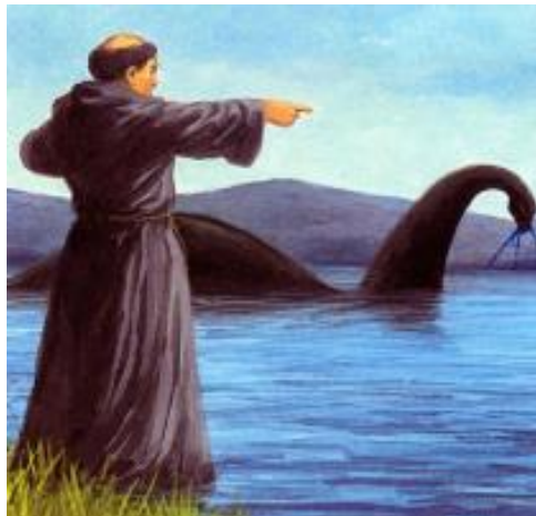
St. Colmcille Overpowers the Loch Ness Monster

Saint Colmcille died in AD597 at the age of 76. Saint Colmcille died in the church, on the altar, in Iona. His monks buried him in the grounds of his monastery on Iona and many years later, his bones were disinterred and are thought to be buried in Downpatrick, County Down, with Saint Patrick and Saint Brigid. Saint Colmcille is one of Ireland's patron saints, along with Saint Patrick and Saint Brigid. He is famous for his prophecies and sayings. He performed many miracles. One of Colmcille's miracles is said to have involved the Loch Ness Monster. This story is the first recorded sighting in history of the legendary creature.