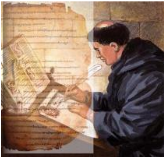
A Page from The Cathach of Colmcille

In 563, Colmcille and twelve monks sailed from Derry to the island of Iona. Iona is situated off the west coast of Scotland. Colmcille was going into exile. The cause is said to have been due to his involvement in the Battle of Cúl Dreimhne in County Sligo. The story is that Colmcille secretly copied a psalter belonging to St Finnian at Moville. King Diarmaid was asked to determine the owner of the copy. King Diarmaid ruled as follows: 'To every cow her calf and to every book its copy.'