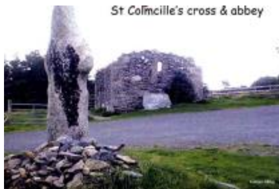
St. Colmcille's Cross and Abbey, Gartan, Co. Donegal

Saint Colmcille was born in Gartan, Co. Donegal in AD521. He was christened Crimhthann, but was known as Colmcille later in his life. His mother was Princess Eithne of Leinster. His father, Fedelmídh, was the great grandson of King Niall of the Nine Hostages. However, Colmcille was sent to be fostered by another family when he was young. This was normal for princes back in this time. He was sent to the house of Cruithnechan, a holy man. Here, Colmcille spent a lot of his time in church, praying and meditating.