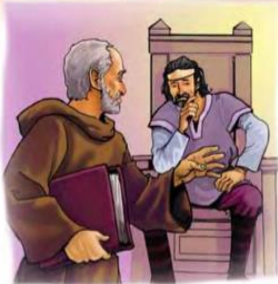
Finnian and the High King

Colmcille returned home to Gartan and he got in touch with the other members of his family. Some of them were delighted to be given a chance to fight the High King and they saw this as a perfect excuse. An army was gathered and a great battle was fought at Cul Dreimhne, County Sligo. More than 3000 men were killed in that battle. When Colmcille saw the horror that he had brought to the people of Ireland, he promised to leave the country and to live in exile (away from his home) for the rest of his life.