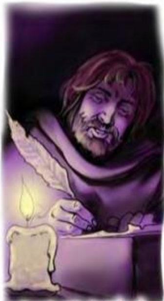
Copying Finnian's book