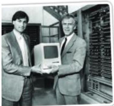
▲ Steve Jobs with a Mac

He was born in San Francisco in the USA in 1955. Growing up he became interested in electronics. In 1976, at the age of 21, he founded Apple Computer Inc. with his friend Steve Wozniak. They built and sold computers. At this time, most ordinary people thought of computers as complicated, expensive machines