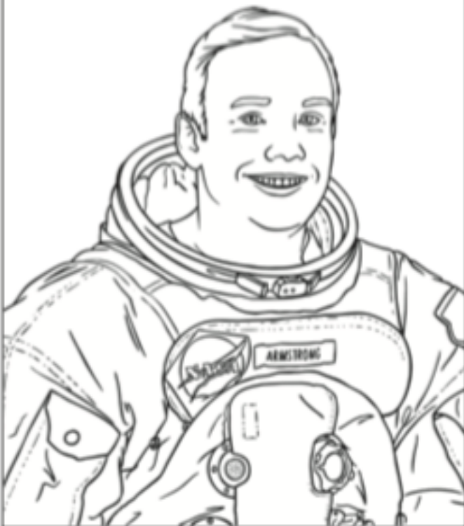
A picture of Neil Armstrong